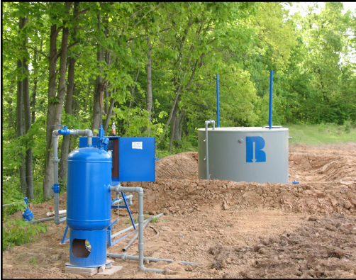
Reserve's Snyder #1, Roane County, WV. Drilled in 2007. Typical Surface Equipment Configuration.

Reserve strictly adheres to a 'quality not quantity' approach to drilling new wells; has the capabilities and flexibility to react to new opportunities in a timely fashion, and, weather permitting, drills approximately 2 Devonian Shale wells per month. The company primarily focuses on drilling in its 'backyard' of Roane and surrounding counties.