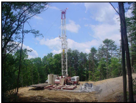
CSi's Rig #2 Drilling Reserve's Olian #3 in Kanawha County, WV in 2005