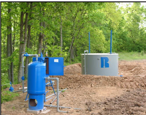
Reserve's Snyder #1, Roane County, WV. Drilled in 2007. Typical Surface Equipment Configuration.

Reserve strictly adheres to a 'quality not quantity' approach to drilling new wells; has the capabilities and flexibility to react to new opportunities in a timely fashion, and, weather permitting, drills approximately 2 Devonian Shale wells per month. The company primarily focuses on drilling in its 'backyard' of Roane and surrounding counties.