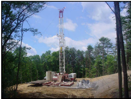
CSi Rig #2 Drilling Reserve's Olian #3 in Kanawha County, WV in 2005